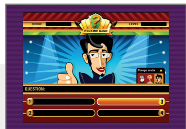
Samples of Composica Mind Games

Programming-free, web-based and easy-to-use, Composica Enterprise is everything you need to maximize course creativity and learner performance.